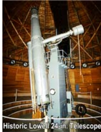
Historic Lowell 24-in. Telescope