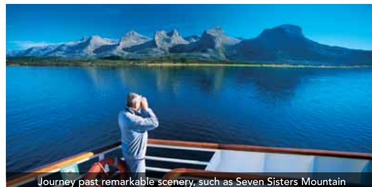
Journey past remarkable scenery, such as Seven Sisters Mountain