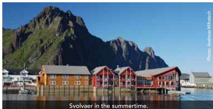
Svolvær in the summertime.