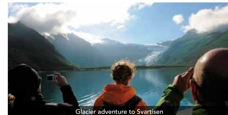
Glacier adventure to Svartisen